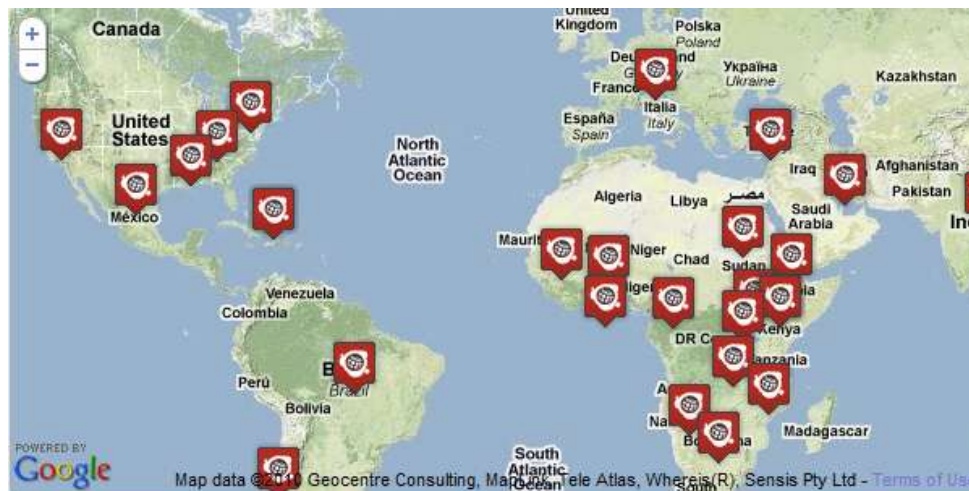
Figure 1 Ushahidi Usage 2

However, the concept of crowdsourcing pre-dates the Haiti relief efforts and has been effectively used in other locations, such as Africa to improve collaboration and developmental efforts, such as Ushahidi in Kenya. It was originally put in place in 2008 to respond to post-election turmoil and was used to map violence and other incidents through both reports submitted via the web and mobile phones. Since then it has grown to include developmental and other efforts. The group's efforts then expanded into help map violence and other issues in South Africa, Gaza, India and Pakistan. 1